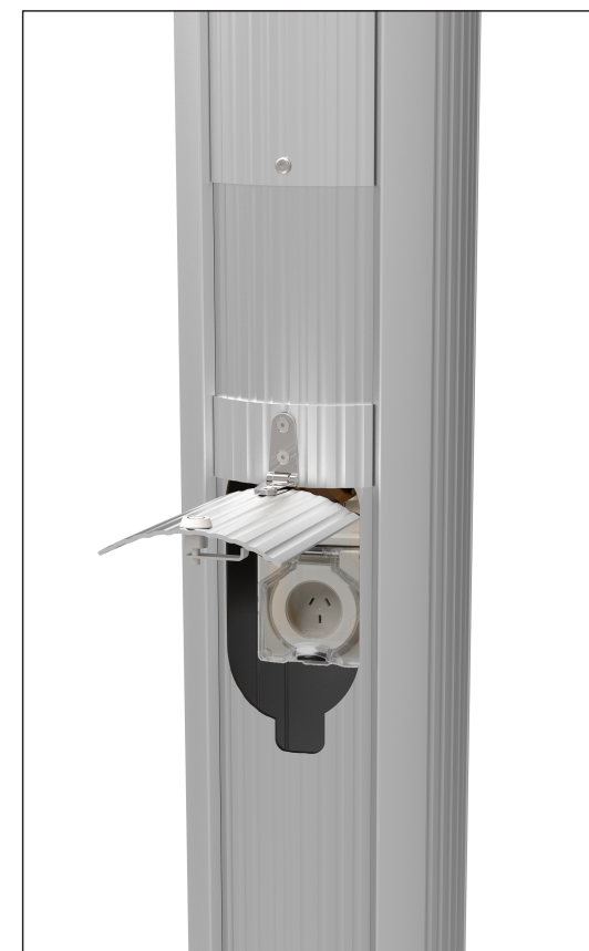
CLIPSAL 56 SERIES 3 PHASE GPO